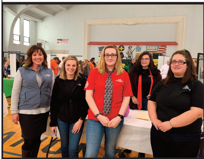
Pictured above: Our Co-Op students working at the Career Fair

The LACC held our 13th annual Career Fair at the end of October, and it was another successful one. We welcomed over 400 freshmen from 6 high schools in Livingston County, and more than 20 local businesses provided informational tables. We were lucky to utilize 60 of our current LACC students to work for us the entire day, and assist in set up and take down. A special "thank you" to all of the businesses that participated this year. We are always grateful. We are already looking forward to our 14th year, so please help us save the date for next year. We hope to see you on October 21, 2020!