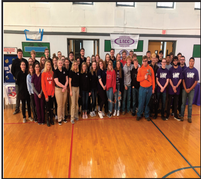
Pictured below: Our wonderful Career Fair student workers